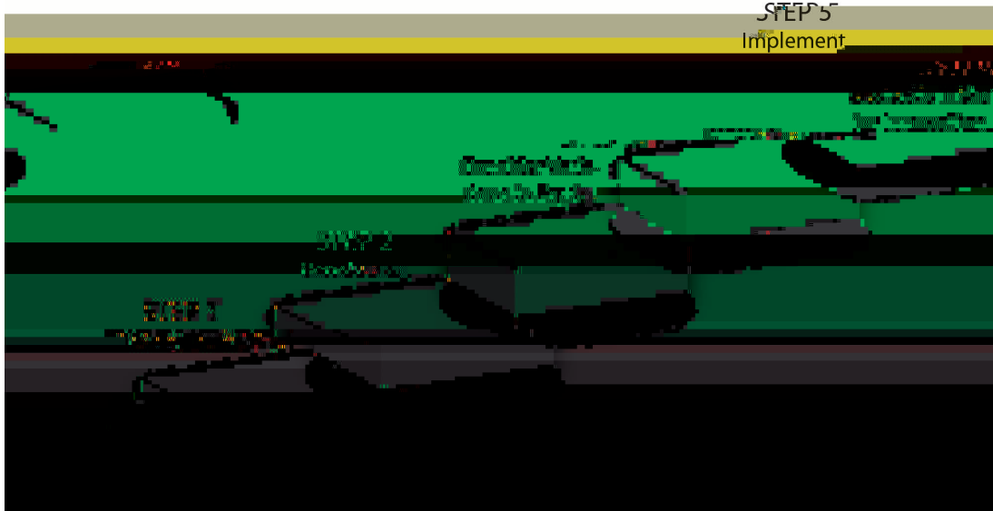
Figure 4: Step 1 of the Compensation and Benefits System Toolkit

Step 1 engages your organization in an audit to assess the equity of your Compensation and Benefits System.